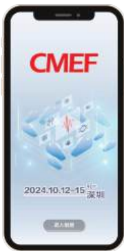
Photo Live Streaming ——Home Page Banner/ Splash Screen Ads

The opening ceremony stage is located near the venue entrance. It is the main entrance for the visitors, which will attract large traffic and high attention.